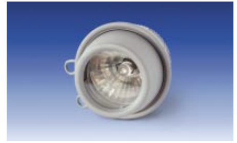
Reading Lights 2LA 007 278-22/23