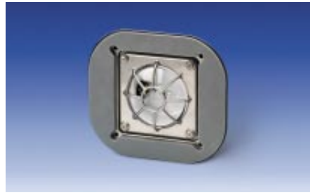
Cargo Compartment Light 2LA 006 823-70