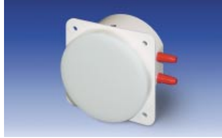
Lavatory Dome Light 2LA 002 692-10