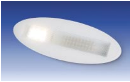
Passageway Light 2LA 455 115-32