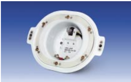
Overwing Emergency Light 2LA 006 954-00